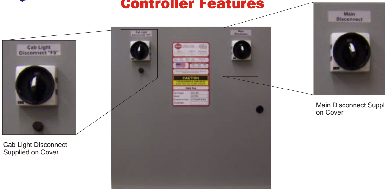
Cab Light Disconnect Supplied on Cover